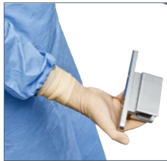
Detachable short side rail Short 8 in / 20 cm rail system enabling accessory mounting and 360° imaging capabilities.