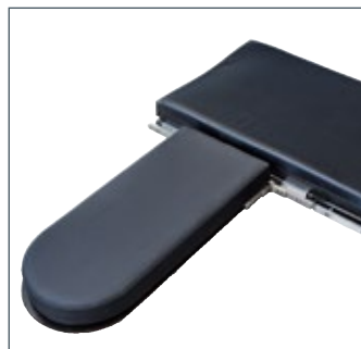
Translucent fistula arm board Provides an unobstructed image and is connected directly to the carbon fiber top.