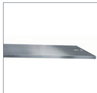
Catheter tray Provides an extended work space, which is attached directly to the table. Available in three lengths.