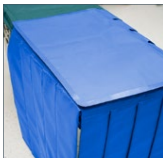
imagiQ2 radiation shield Tailored and easy to fit protection against scattered radiation with lead rubber (0.5 Pb) material.