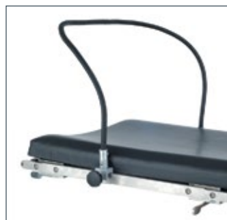
Anesthesia screen Provides a sterile barrier separating the surgical field from the patient's head.