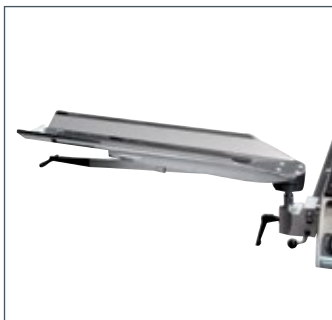
Adjustable arm board Nontranslucent board provides ideal support for the patient's arm during IV.