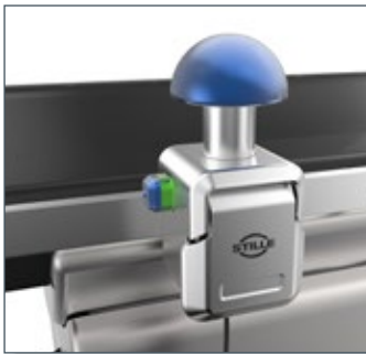
Extra pan handle Extra pan handle allows panning the table from different sides