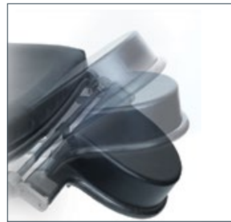
Adjustable procedure headrest Fully translucent headrest, ensures easy intubation and superior carotid visualization. It fits the free end of the table and is side rail mounted.