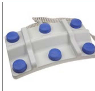
imagiQ2 foot control Compact multipedal footswitch for discrete placement beneath the table with soft touch buttons and a light operating force.

The imagiQ2 offers a large line of accessories for vascular tables and can be upgraded with features and detachable table tops for different purposes when it is needed.