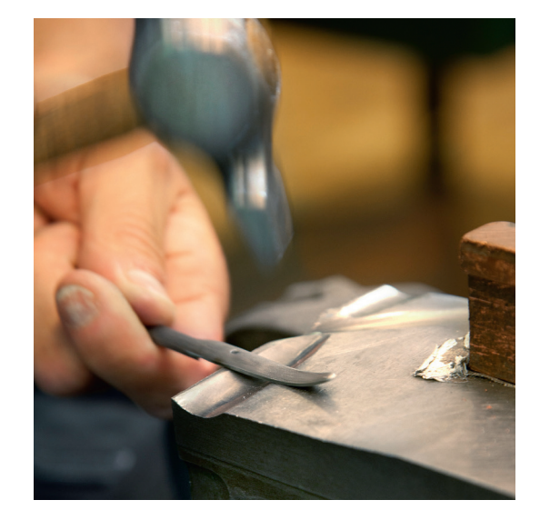
STILLE Scissors for Plastic Surgery