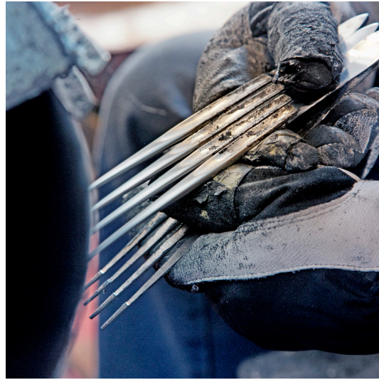
Stille Forceps for Plastic Surgery