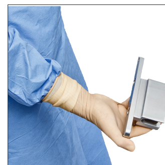
Detachable short side rail