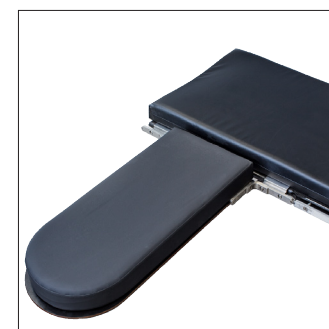
Translucent fistula arm board

Package offers 20% savings over individual items purchased separately.