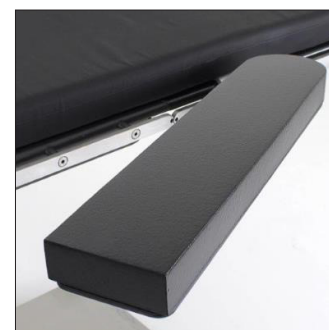
Basic arm board