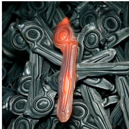
Stille Needle Holders for Plastic Surgery