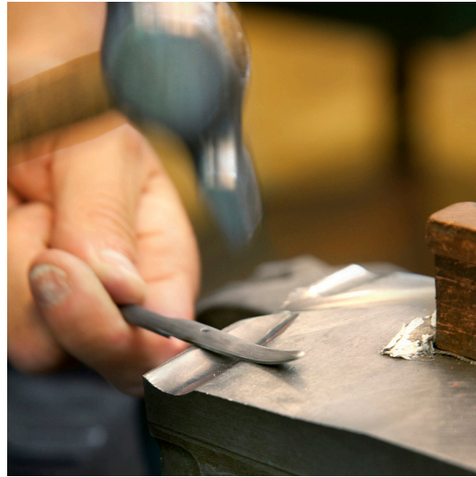
STILLE SuperCut XE