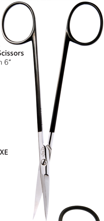
101-8167-151 Stevens-STILLE SuperCut XE Tenotomy Scissors Curved 15 cm 6"