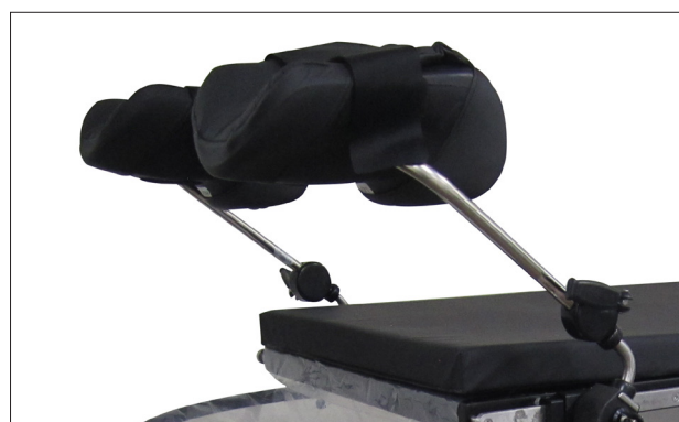
505-1126 Leg holders Goepel (pair)