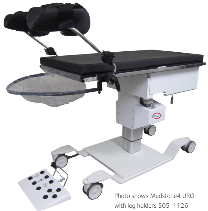
Photo shows Medstone4 URO with leg holders 505-1126