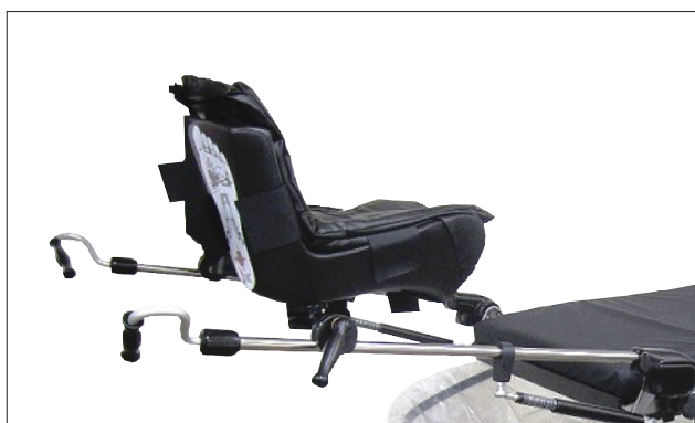
505-1114 Leg holders with gas spring support (pair)