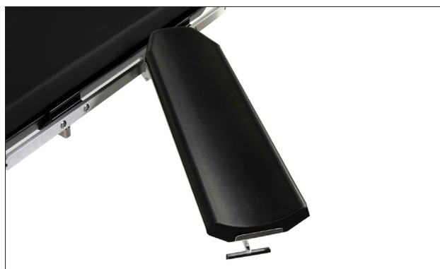
514-50-3SR025 Adjustable arm board with pad