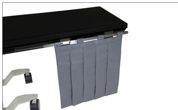
535-1772 Radiation shield loop grey