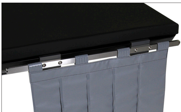
505-1181 Detachable side rails (pair)

*Accessories attaching to the two detachable side rails 505-1181.