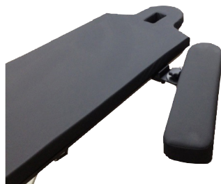
Optional arm board