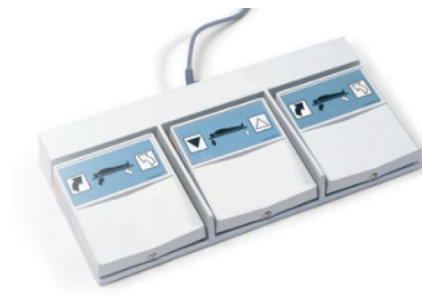
Optional 3 movement foot control shown